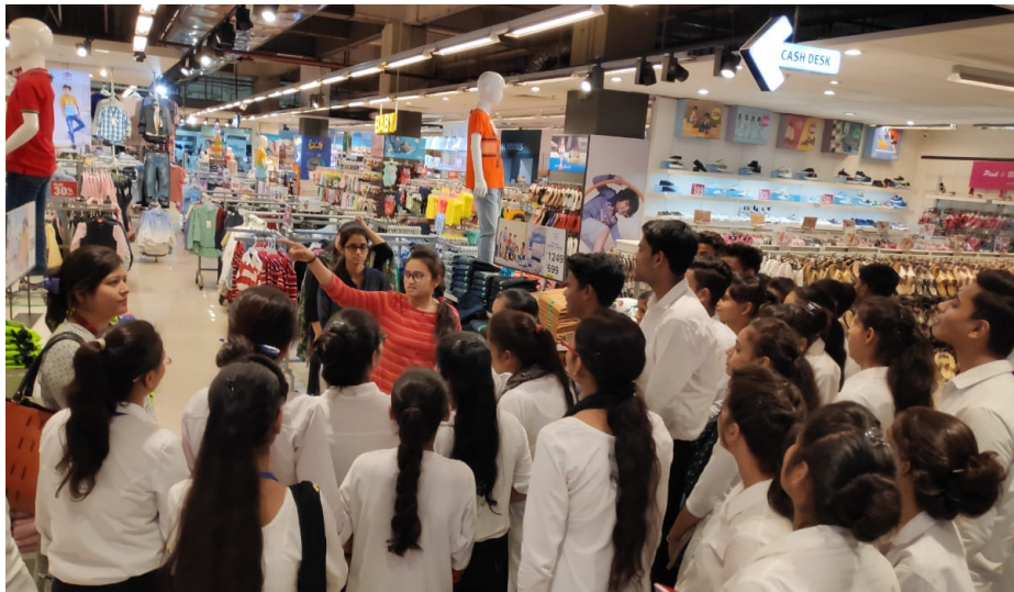
Picture of a Exposure Trip

Exposure trips were organised for each batch. The purpose of these trips was to give the students the idea of the work environment. These trips were organised in Big Bazaar, Pantaloons and Reliance Trends.