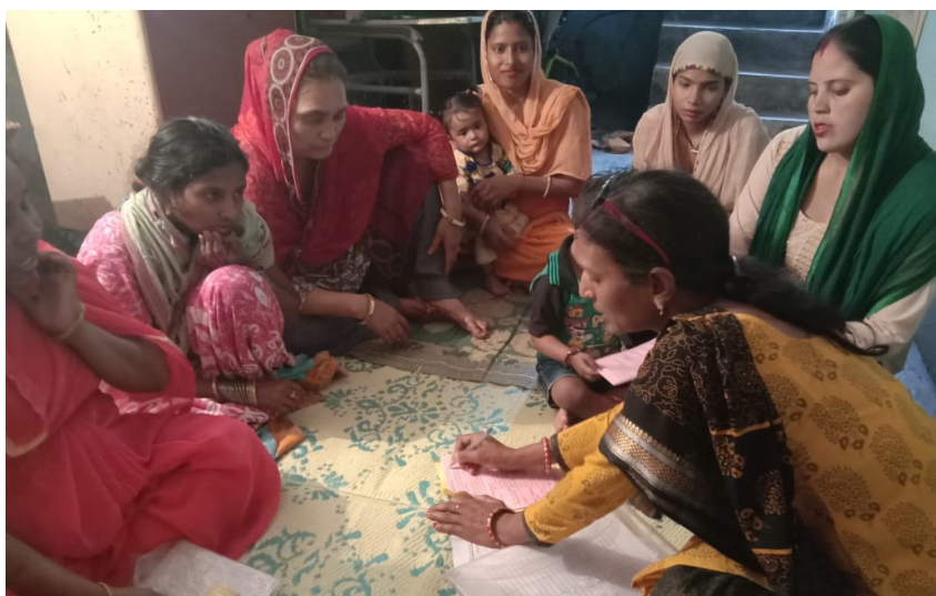
Picture : Meeting with Mothers' Committee