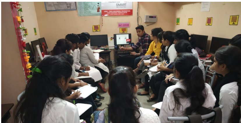
Picture of a CRS Class

This program is run in collaboration with Tech Mahindra Foundation. Under this program, IT and English curriculum was taught to the students to enhance their skills which will help them while working in the market. In addition to the IT and English curriculum, Customer Relationship & Sales (CRS) helped the candidate to enhance their market skills. The course involves marketing communications, sales support, technical assistance and customer service.