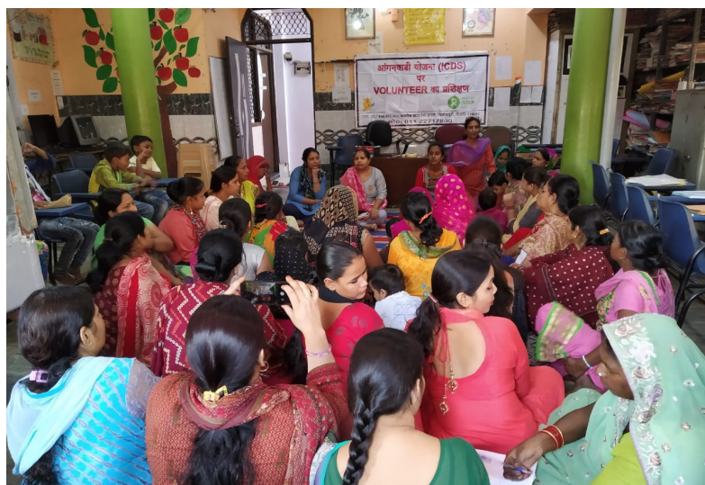
Picture : ICDS Training in progress

Similar to the work with schools, 20 volunteers were trained on provisions of ICDS and other laws, to initiate community based monitoring of the ICDS facilities. Three trainings were held. Of which 1 training was of the volunteers and two trainings were of the mothers of the children coming to the ICDS centers. The idea was to stimulate the Mahila Mandal/ Mother's Committee of the ICDS centres.