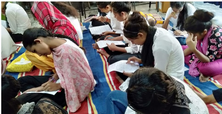
Picture : Evaluation Test in Progress

Building on the experience of previous years, this year the curriculum was improved to include better methods of learning both spoken English and computer operations. For instance, from this year, the curriculum had a lot of focus on speech and pronunciation, learning by doing (role play) etc. To improve pronunciation audio aids were used, where the girls were played audio to help them hear the exact pronunciation of particular words and improve their own. The English curriculum focuses on reading, writing, comprehension and simple communication in English. The computer operations course also follows a 90 days curriculum and includes, MS office with special focus on Microsoft Excel. The course has a component of teaching typing to all students.