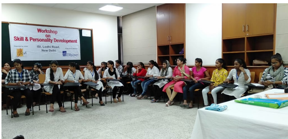
Picture : Workshop on Skill & Personality Development