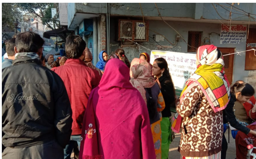
Picture : EWS Information Camps

The online application started from the December 15th and continued till February 14th, 2020. 190 application forms were submitted this year, out of which 10 students named appeared in the draw of lots done by the government of Delhi. Camps were held at different spots in the community to help parents with documents for the online process.