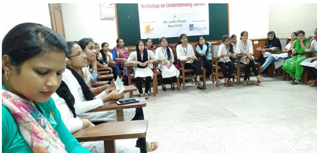
Picture : Workshop on Gender