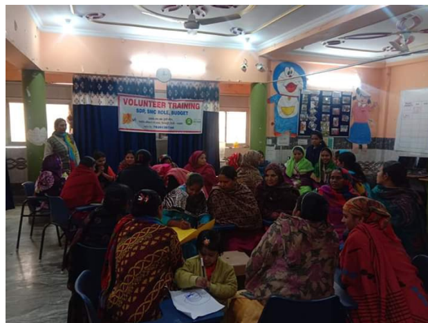
Volunteer Training Session in Progress

During the course of the program, the volunteers worked with the school and made significant changes in the school. The program ended with the JOSH awarding the volunteers with certificate of appreciation and token gift.